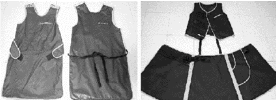
Fig. 1. One-piece type apron(left) and Two-piece type apron(right).